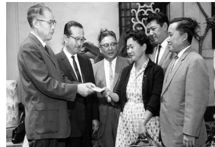
The grand prize winner of the raffle tickets wins a round-trip ticket to Japan donated by Asia Travel Bureau.