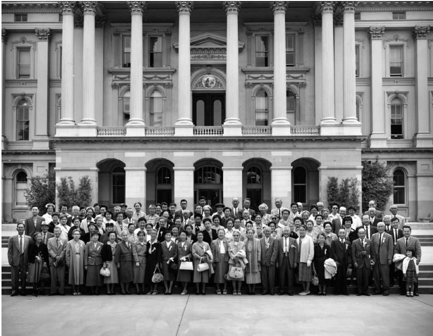
Fujin-kai members and their spouses stand in front of the State Capitol Building in Sacramento. Bus tours to cities such as Sacramento, Santa Barbara, Fresno and Las Vegas become a Fujin-kai tradition and last for several years.