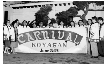
Members of the Sonen-kai show off their handiwork heralding the weekend carnival.