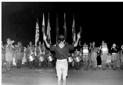
Troop 379 participate in the Asian Jamboree near Gotemba, Shizuoka. In addition, the troop make a guest appearance on NHK television, and perform at the opening ceremonies of the Koshien Baseball Championships before 60,000 people