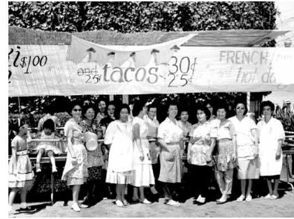
The ladies of the Sonen-kai help with food booths selling hamburgers, tacos, and teriyaki BBQ chicken.