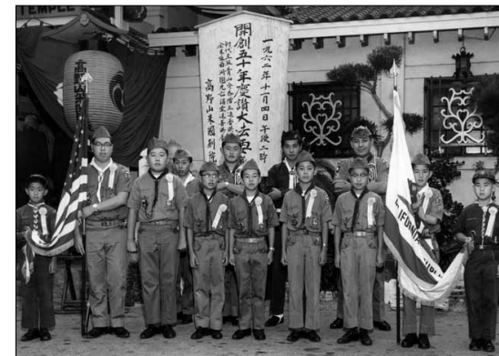
The Sonen-kai (YAA) evolves into the group now known as the ABA (Adult Buddhist Association).