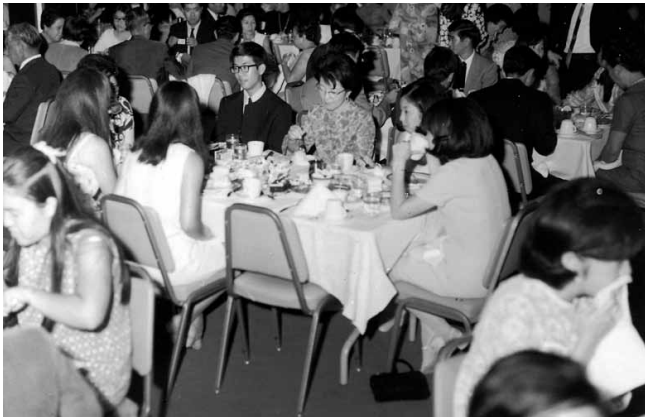
Left: The members of the Jr. YBA enjoy a dinner banquet in Waikiki, Hawaii.