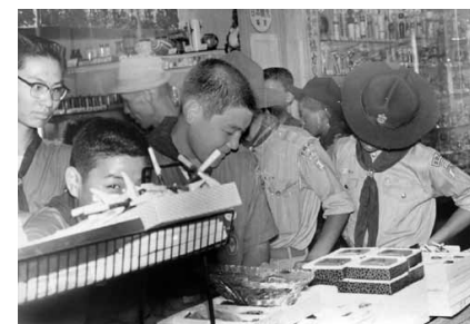
From July 31 to August 21, the Boy Scouts travel through cities such as Tokyo, Kamakura, Nagoya, Osaka and Hiroshima.