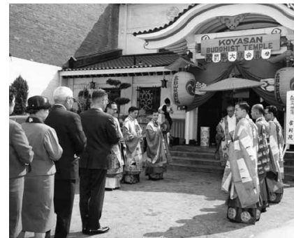
Cabinet members and ministers in procession to enter the Temple.