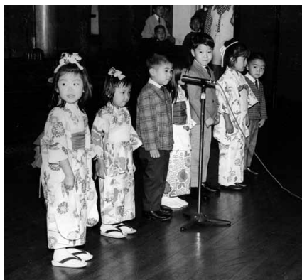
Children of Sunday School give various performances during the Oseibo Taikai.