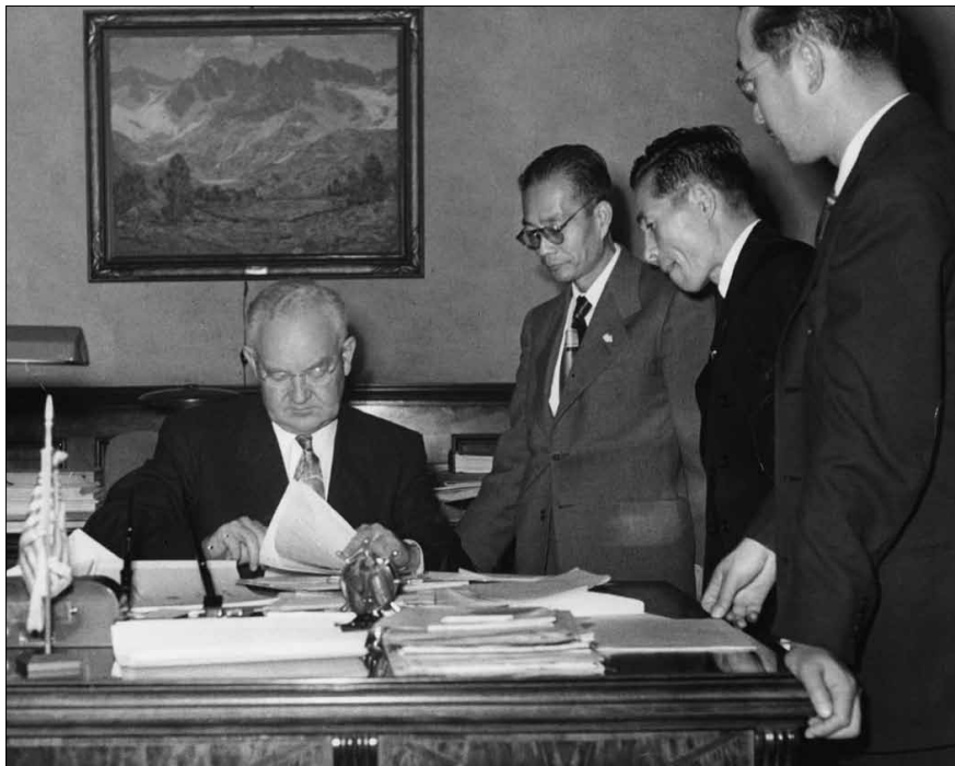
Reverend Ryosho Sogabe and members of the Cabinet meet with Los Angeles Mayor Fletcher Bowron. In all likelihood, the purpose of the meeting is to receive permission from the Mayor to hold some sort of public event at the Temple.