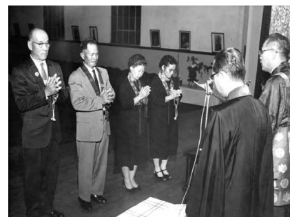
Goeika group from Sacramento.