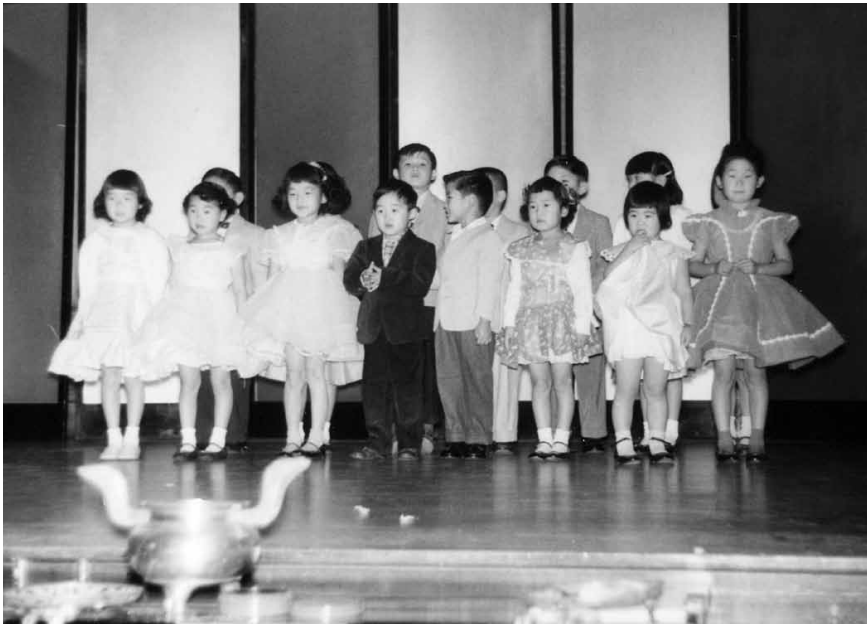
The Sunday School children put on a program of performances: Skits about the birth of Sakaymuni Buddha, the Buddhist songs such as Iroha Uta and When We See the Golden Sun; and the recitation of the Golden Chain.