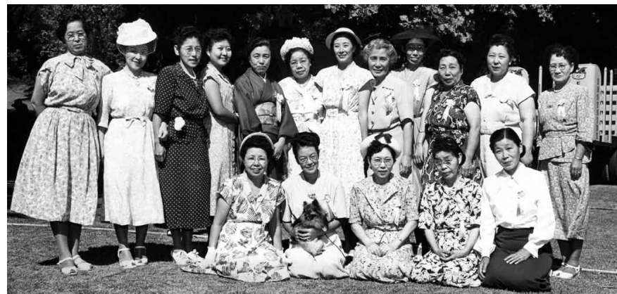
Members of the Fujin-kai in the mid 1950's.