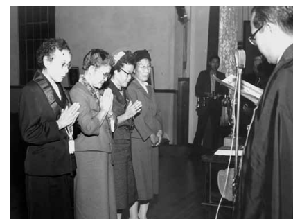
San Jose Daishiko Goeika group.