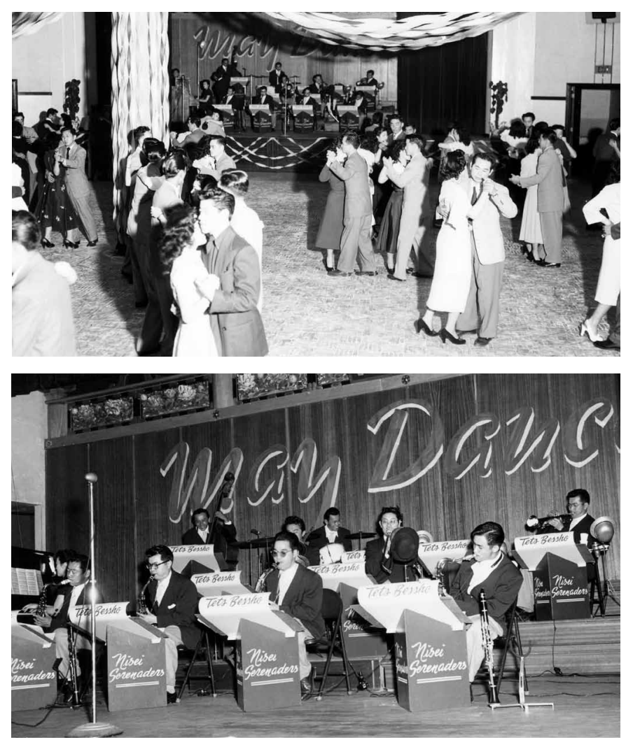
On May 13, 1949, the Temple sponsors a dance with the Nisei Serenaders performing.