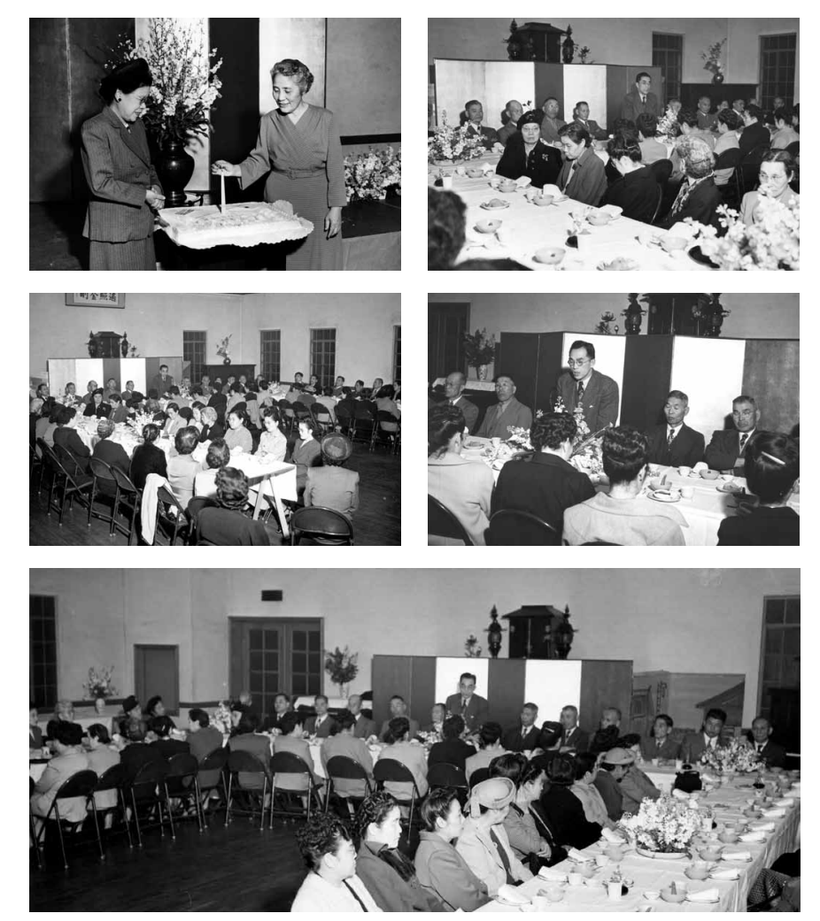
The Temple often sponsors Japanese-American community events during the 1950's with the Nisei Veteran's Appreciation Dinner, held in 1950, being just one example.