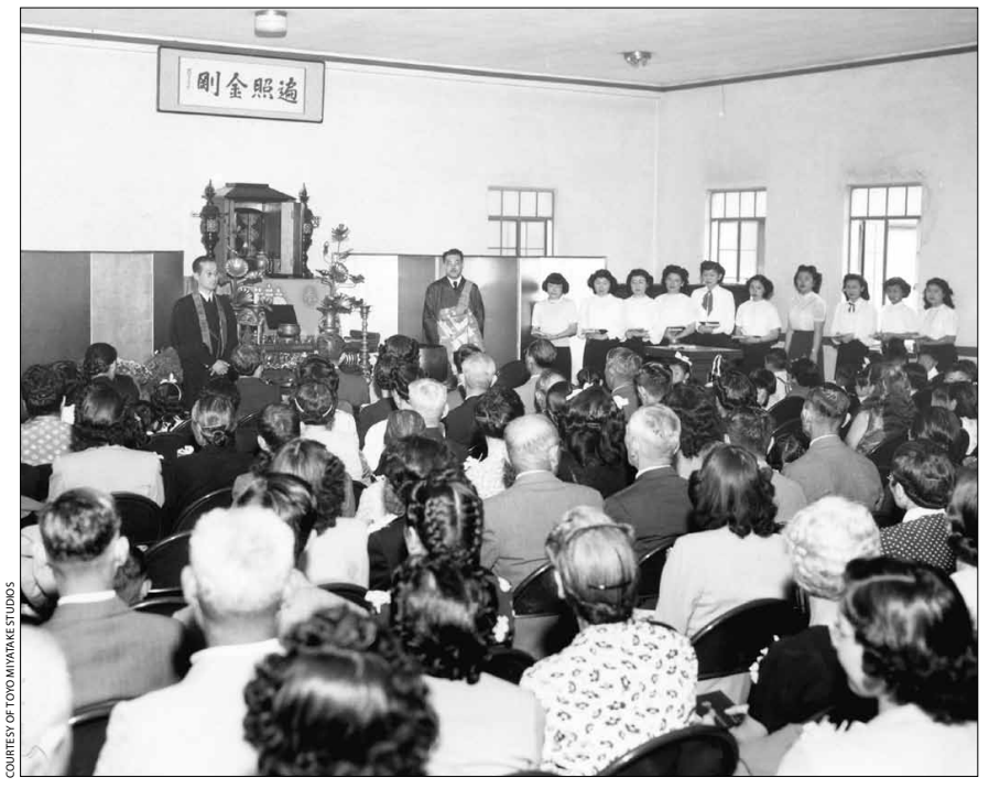
Members of the YBA Girls are introduced and installed as officers of the cabinet at the second floor chapel.