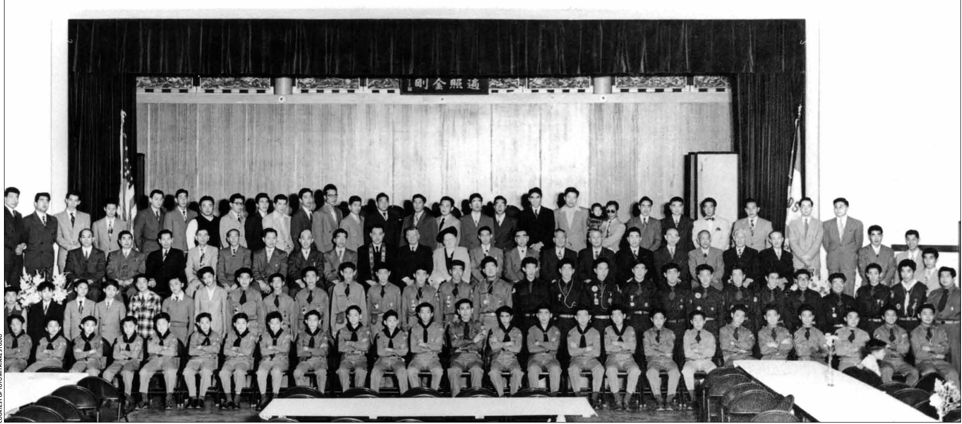
The Boy Scouts of Troop 379 have their 19th Reunion on November 12, 1950. In the early 1950's with the trauma many Scouts earn their Eagle Scout rank.

Boy Scout Troop 379 Reunion -November 12, 1950