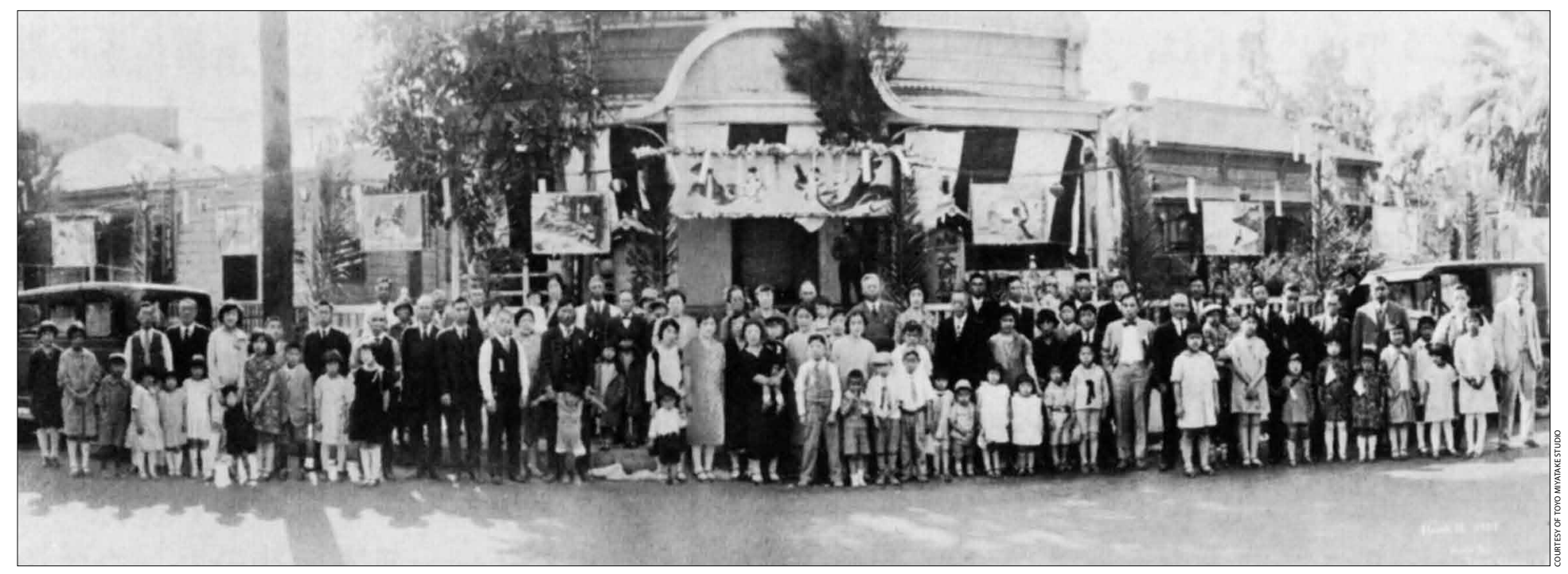
It is believed that this photo was taken as the congregation gathered for the preparation of the Shomieku \,