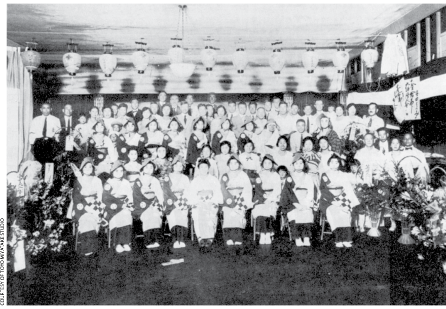
Members gather for the Obon Odori and the Obon Segaki Service at the Daishi Kyokai on Central Avenue in the summer of 1922.