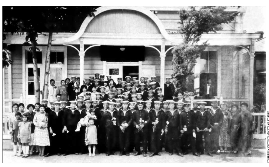
The crew of Special Service Vessel, Jin'i, gathers in front of the Daishi Kyokai with members of the Fujin-kai.