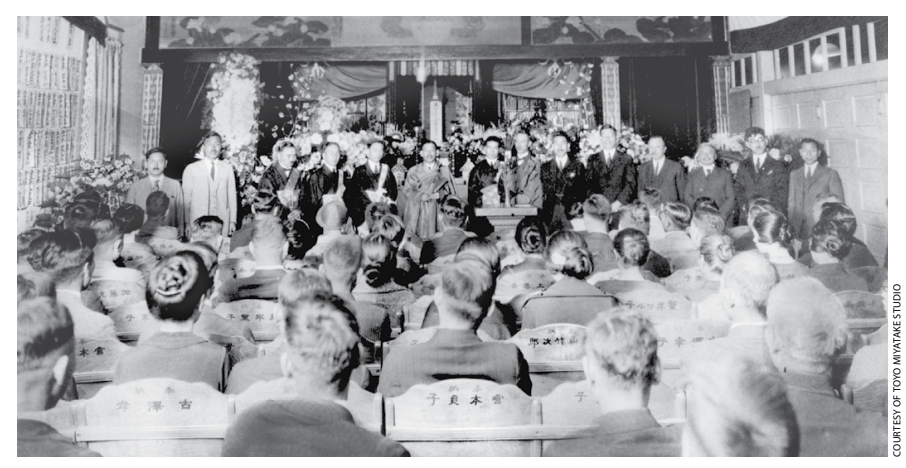
Members gather to mourn for the victims of the Great Kanto earthquake at the Daishi Kyokai.