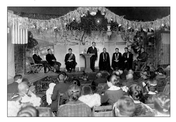
Shomieku -March 1917

Priests of the Daishi Kyokai address the congregation in 1917.