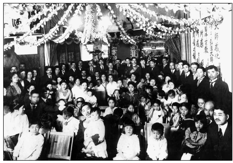
The congregation gathers to commemorate Shomieku, the day Kobo Daishi entered into eternal samadhi, at the Daishi Kyokai on Commercial Street in 1915.