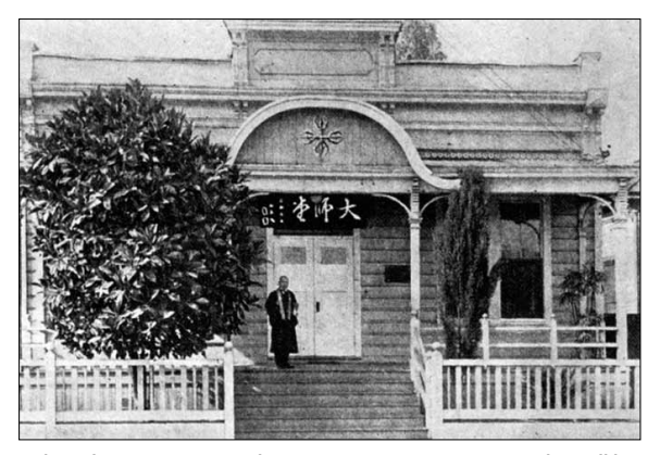
Bishop Shutai Aoyama stands next to a Moreton Bay Fig tree that will be recognized as a living landmark by the City of Los Angeles in 2008.