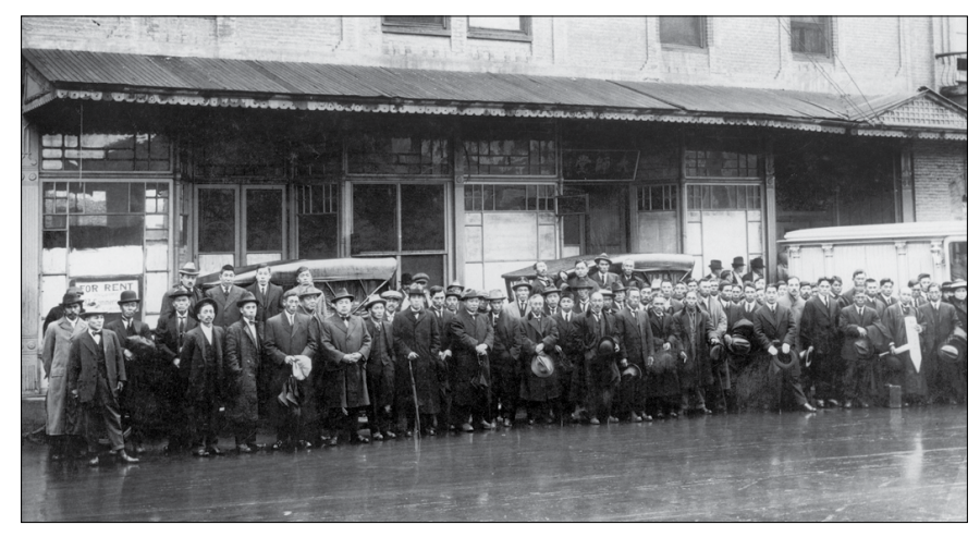
The Daishi Kyokai is relocated on October 2, 1913. A service celebrating the move is scheduled for November 1st and 2nd, but due to the delay of the Buddhist fittings for the alter, the service is postponed until March 21, 1914.