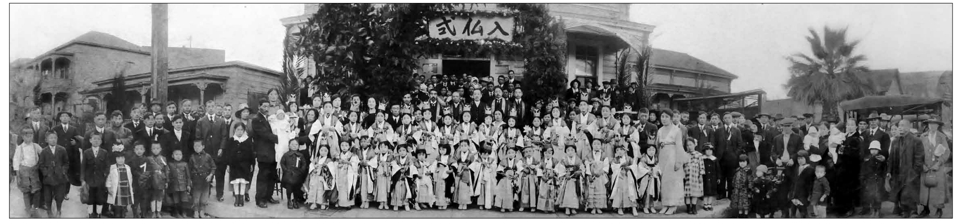
Congregation gathers to commemorate the opening of the new Daishi Kyokai on Central Avenue.