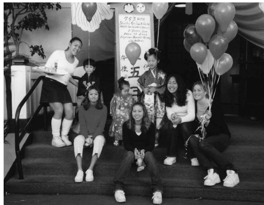
Above: For the second consecutive year, students from South High School in Torrance assist at the Shichi-Go-San service in 2001.