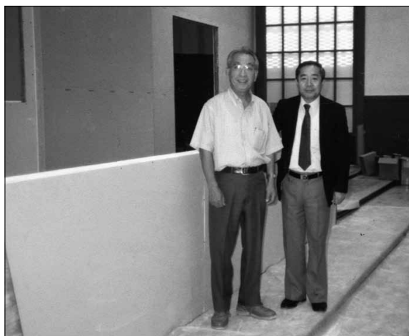
Above: Completion of the Nokotsudo.