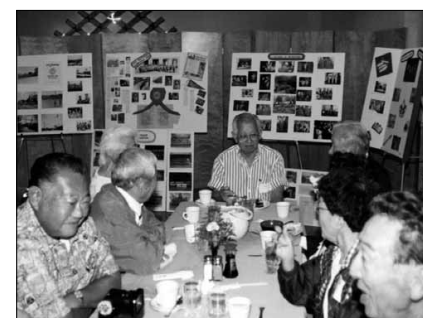
A reunion at the Japanese restaurant, Sambi, in Downey, California. Colorful displays in the banquet room chronicle the history of Troop 379, while past scouts, mothers and wives of scouts reunite and tell stories, recounting their past memories as if it were yesterday.