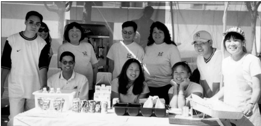
Students of South High School and members of YABA sell drinks and hurricane popcorn at the Chibi 5K Fair in the Summer of 1999.