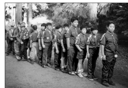
Cub Scout Summer Camp 1992.