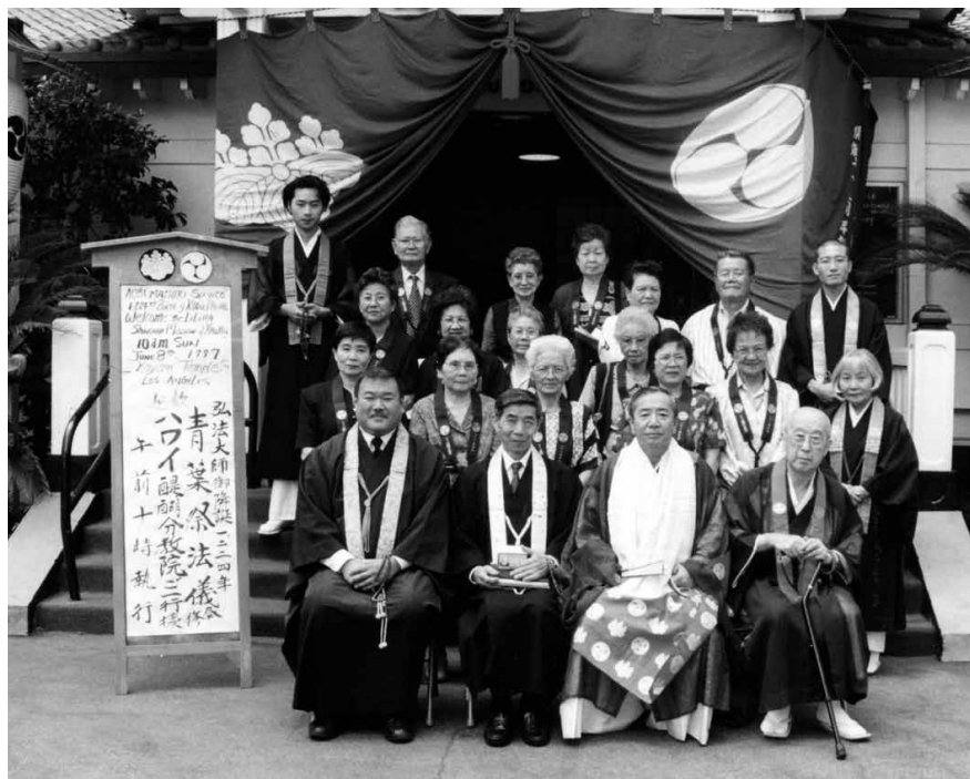
Goodwill visit between Los Angeles and Hawaii - A contingent from Liliha Shingon Mission of Honolulu comes to visit the Temple on Aobamatsuri in 1997.