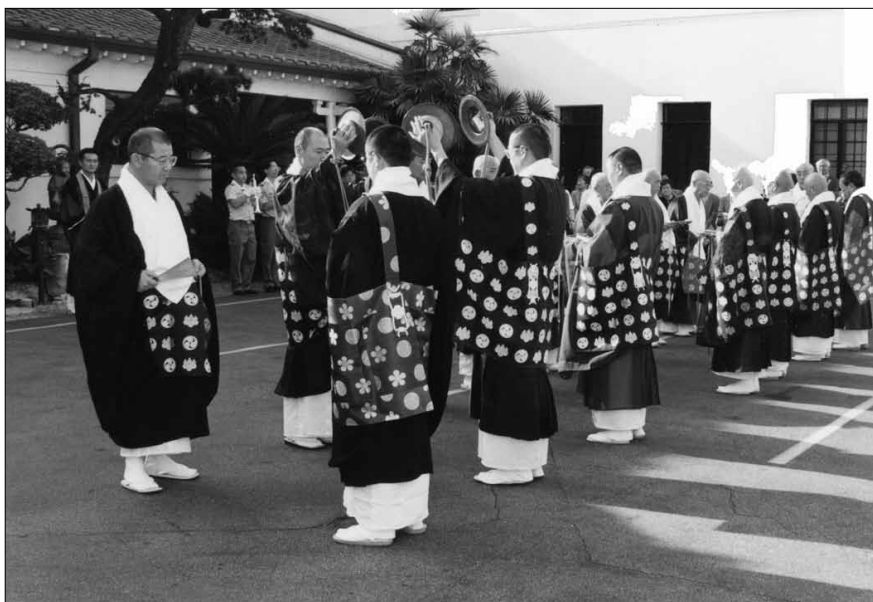
Visiting priests from Mount Koya begin a service in the Temple courtyard.