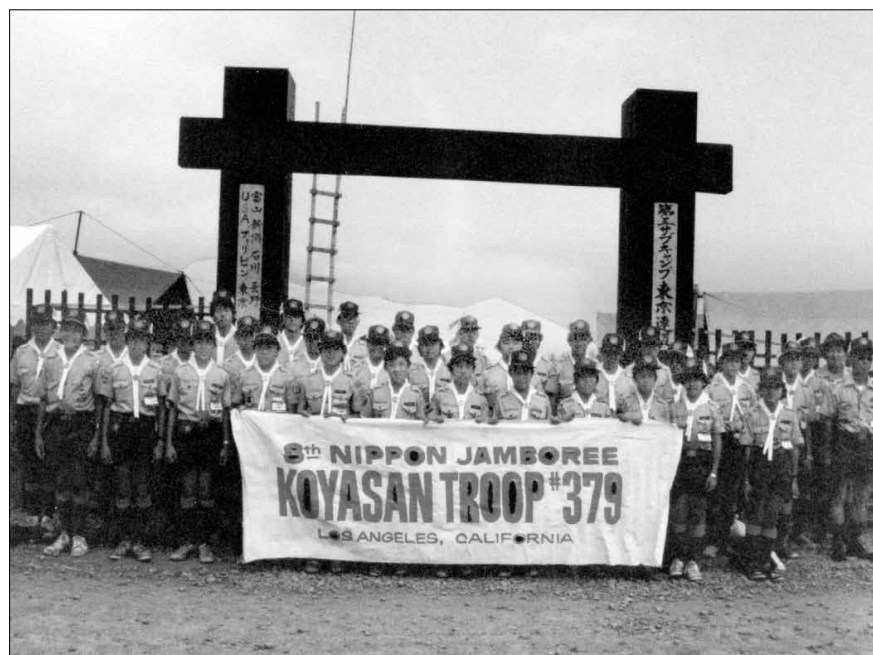
Top: At the Los Angeles International Airport, Koyasan Troop 379 gets ready to go to the Nippon Jamboree. Above: The Boy Scouts proudly show off their banner at the third subcamp in Tokyo.