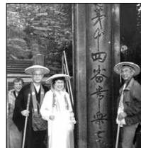
Jorakuji Temple (No. 14).