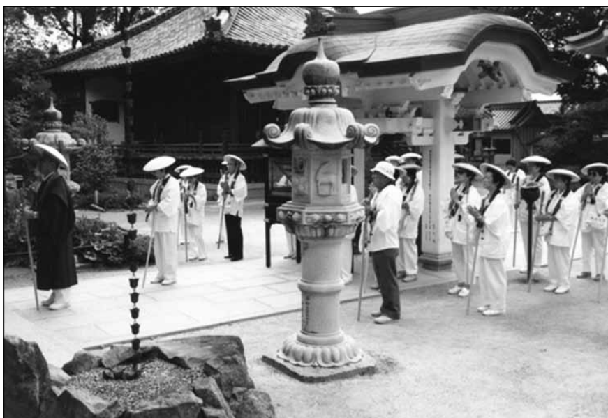
The group recites the Hannya-Shingyo sutra, which is a standard ritual when visiting the 88 temples of the Shikoku Pilgrimage.