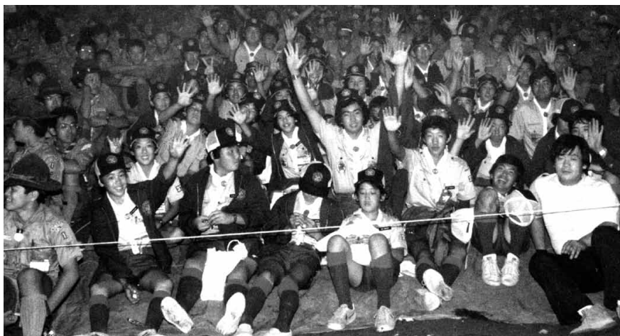
The 8th Nippon Jamboree proves to be an uproarious time for the Boy Scouts of Troop 379.