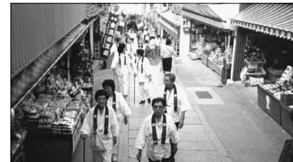
Strolling through the pathway to Konpira Shrine.