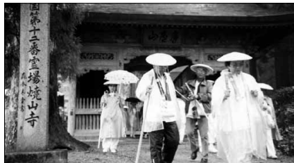
Shosanji Temple (No. 12).