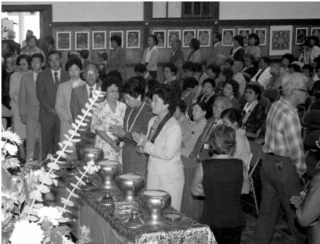
Above: Ministers explain the meaning and procedure of the Kechien Kanjo.