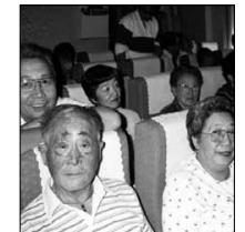
Returning to Los Angeles.