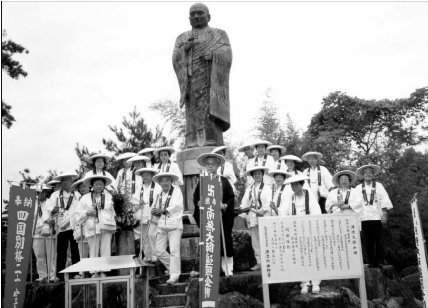
At Lake Manno in front of the Kobo Daishi statue.